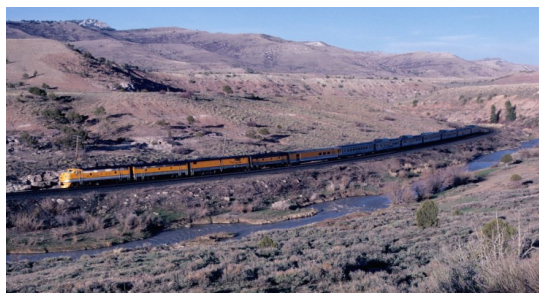
Both photos, Price River Can- yon in the Wa- satch Mts of Utah May 1979

This month's Coal Division meeting I am hoping to present a picture show from slides I took back in the late seventies and early eighties on the Denver & Rio Grande Western in Colorado and Utah. The Rio Grande was a feisty little operation which hustled to compete with it's much larger competitors.