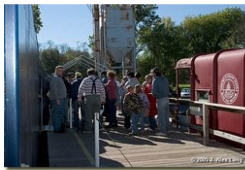
Boarding passengers at Romney