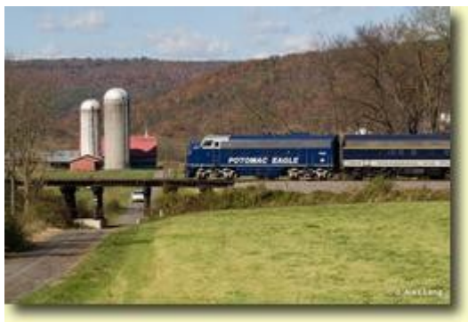
Passing a Farm south of Springfield, WV

Check out the photos below and on page 5