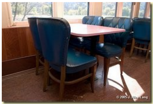
On select trips, regular ticket holders may opt for table seating as shown. We will be using a car such as this.

Respectfully submitted: Dan Mulhearn, acting Division Clerk