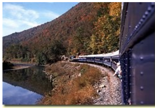
Passengers enjoy the view of The Trough